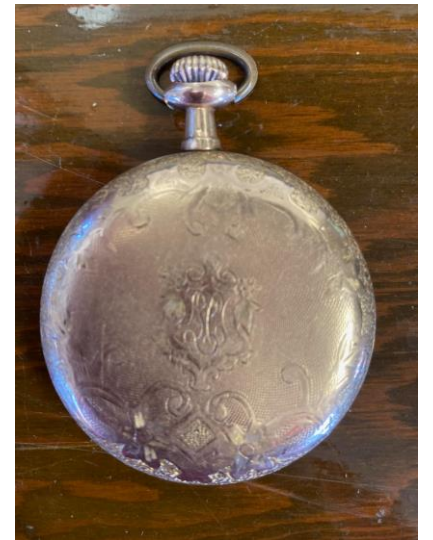
Above: Ludwick Chrzanowski's pocket watch.