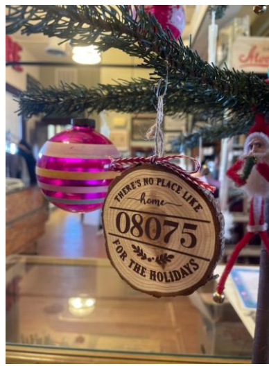
Wooden ornament $10/ea

Each ornament is approximately 3" in diameter. Only available through 2022, while supplies last.