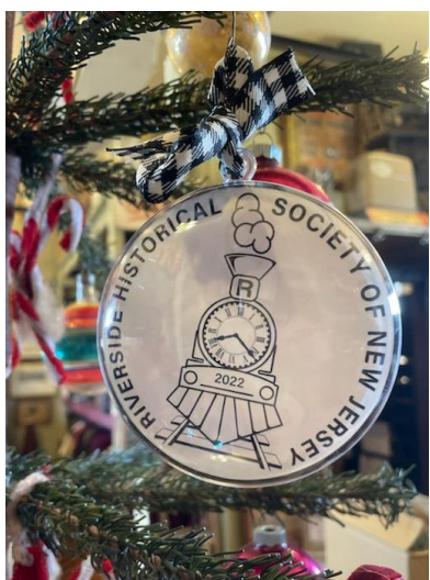
Acrylic flat ball featuring train outline or RHSNJ seal $8/ea or 2 for $15